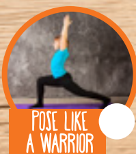
POSE LIKE A WARRIOR