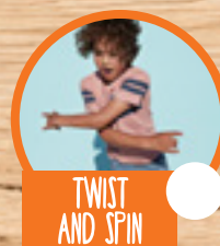
TWIST AND SPIN